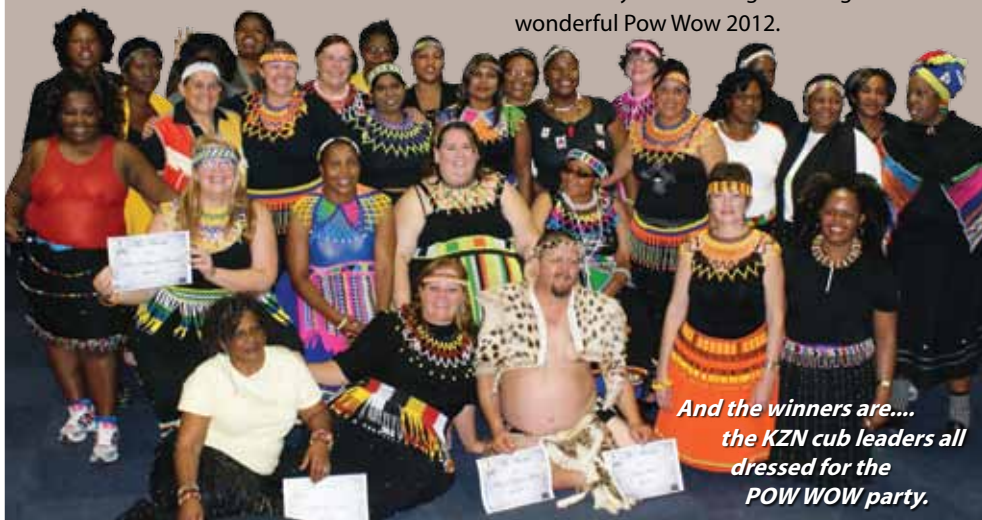
And the winners are... the KZN cub leaders all dressed for the POW WOW party.

Thank you Gauteng Contingent for a wonderful Pow Wow 2012.